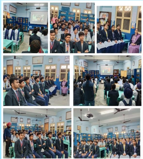
Live Telecast of Pariksha pe Charcha for the Students on 10 th February, 2025