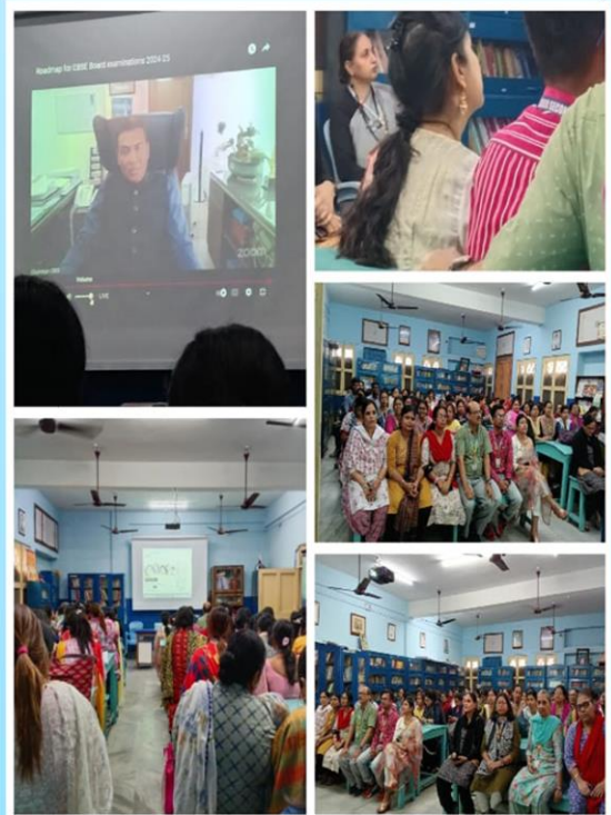
Live Telecast of Roadmap of CBSE Examination 2025 for the Teachers on 14 th February, 2025