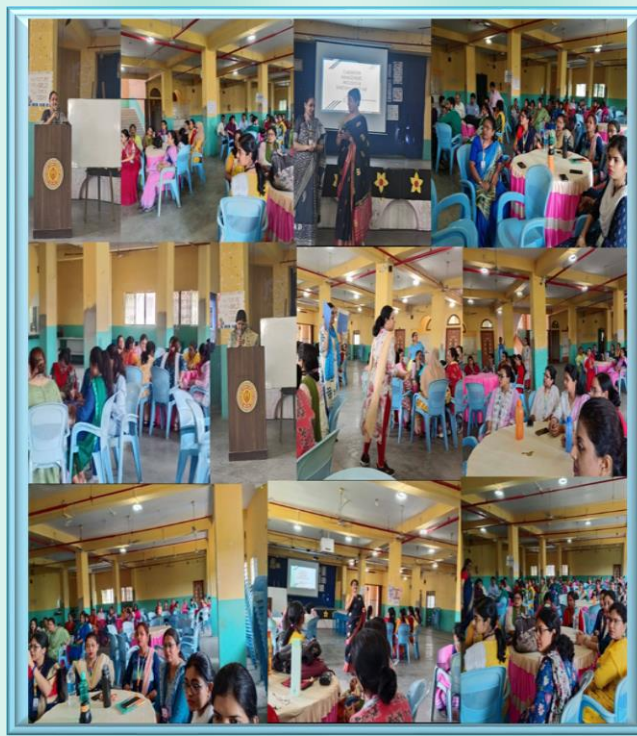
Workshop for teachers on Emotional First Aid was held in our school auditorium on 26th March, 2025