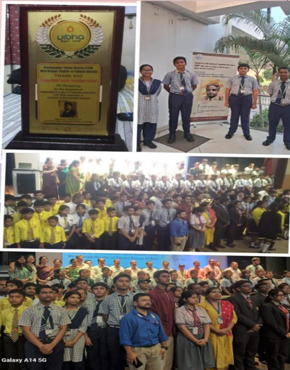
Our students participated in Inter-School Debate, Quiz and Painting Competition at IIT KHARAGPUR RESEARCH PARK on 9th March and received the certificate of participation