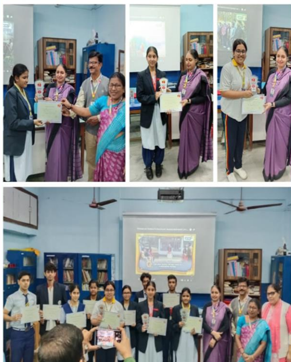
Winners and Participants of Newspaper Influencer Competition were awarded by The Times of India NIE on 10 th February, 2025