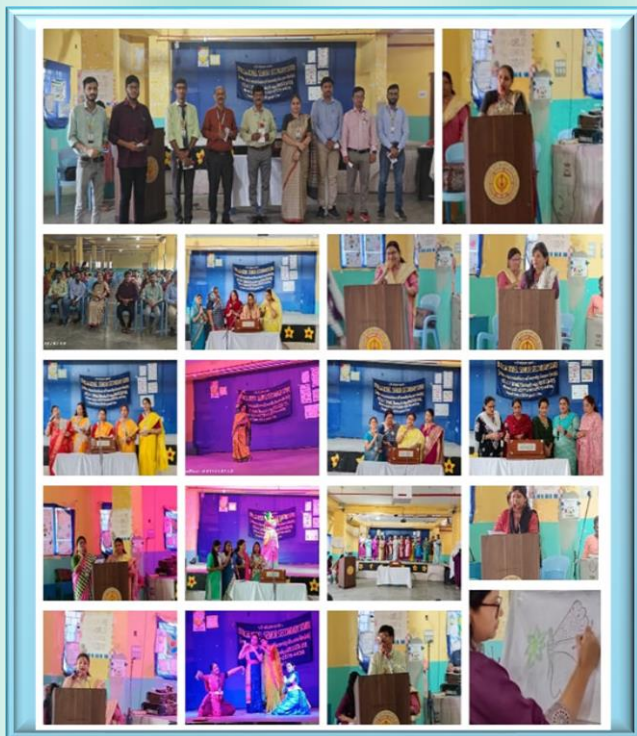
A cultural programme was held in the school auditorium on 25th March, 2025 where the teachers actively participated.