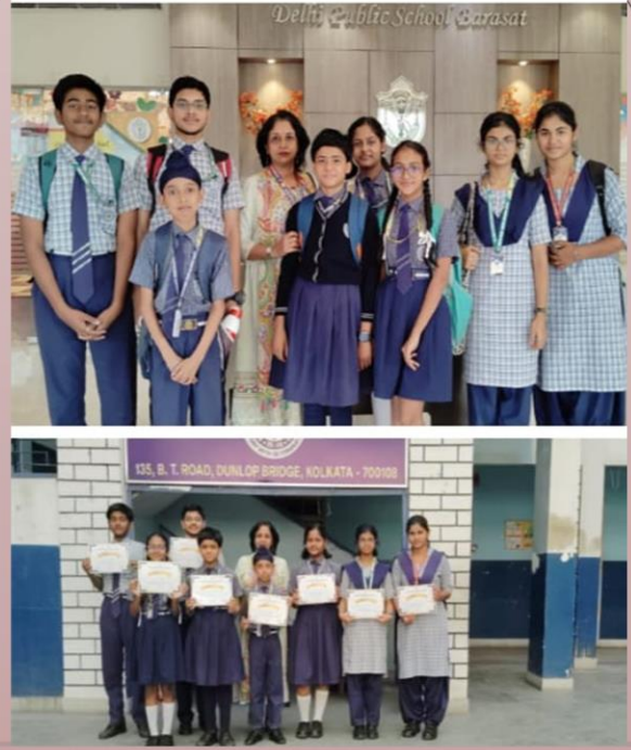
Students of IV-VIII participated in an Inter-School Painting Competition organised by DPS, Barasat on 8th March and received certificate of participation