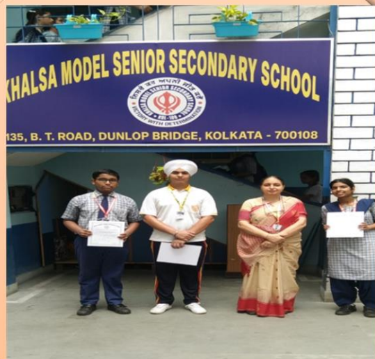
Winners of Quiz Competition