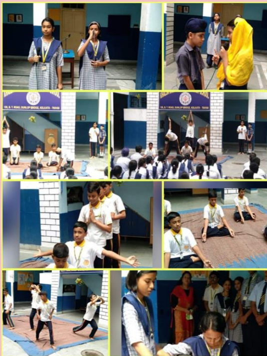
INTERNATIONAL YOGA DAY & WORLD MUSIC DAY