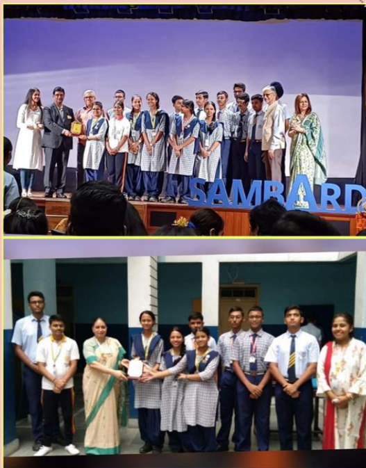
Our school received 3rd prize for COMMUNITY SERVICE MEDICAL from ROTARY CLUB, Kolkata at Sri Sri Academy on 20th June, 2024