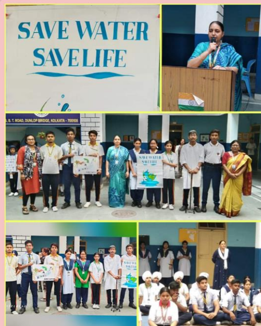
CONSERVATION OF WATER