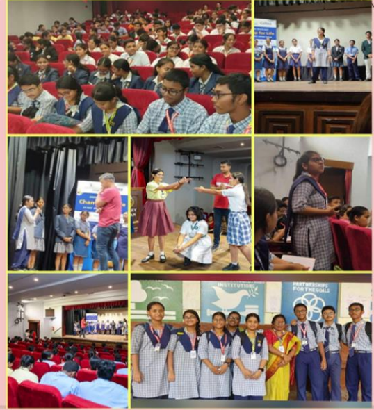
Members of KMSSS INTERACT CLUB participated in the Rotary - Interact Mental Health Meet on 23rd May, 2024 at Rotary Sadan, Kolkata.