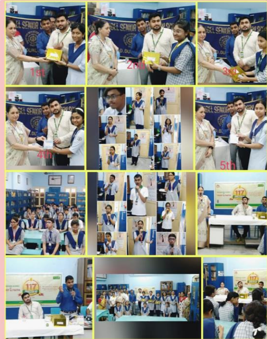
Speech competition for classes IX -XII was held on 24th June in our school which was sponsored by Punjab and Sind Bank to celebrate the Foundation Day of Punjab and Sind Bank