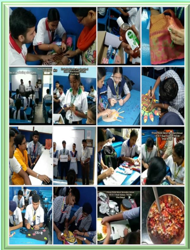
Day 5-SKILLFUL DAY