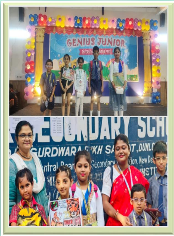
Students from KG to class IV participated in Inter school competition at Ruby Park Public school on 20th July, 2024