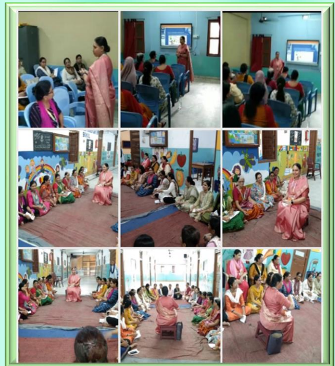
Day 2-FUNDAMENTAL LITERACY AND NUMERACY DAY