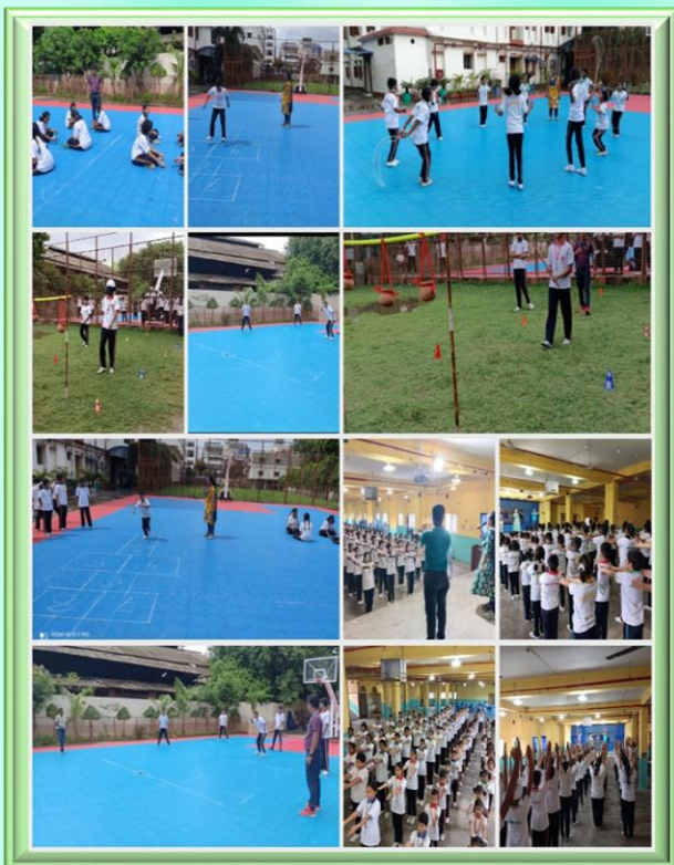
Day 3- SPORTS DAY