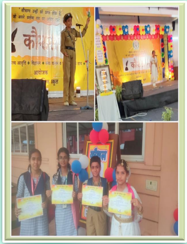
Four students participated in an Inter school competition at Ruby Park Public school on 31st July, 2024. They received the certificate of participation