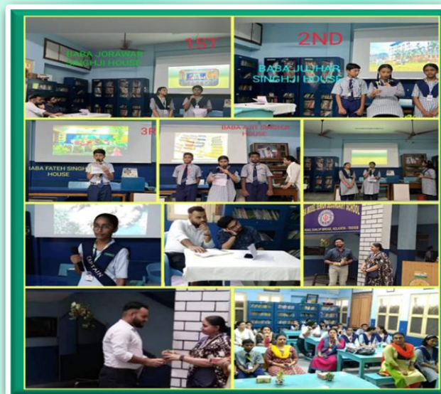
BUSINESS PLAN PRESENTATION