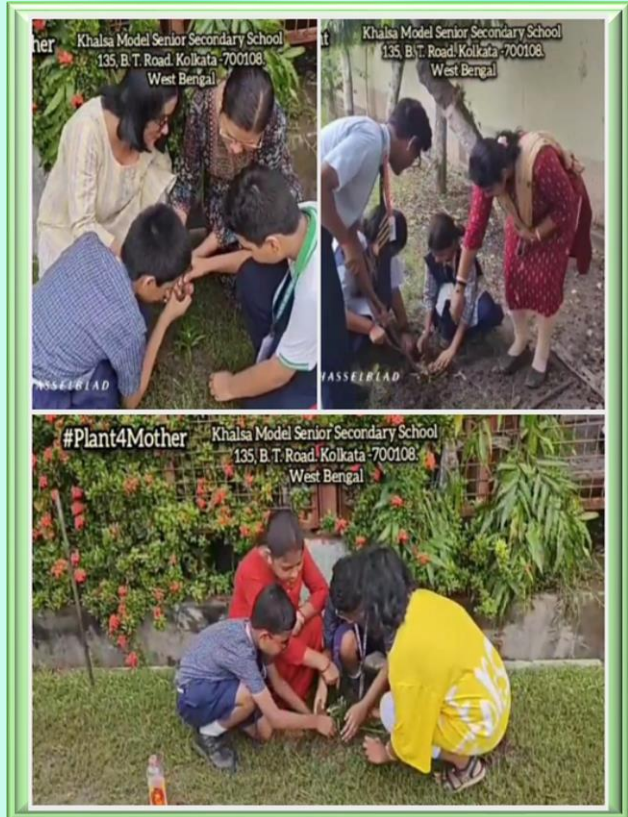
Day 6-ECO DAY