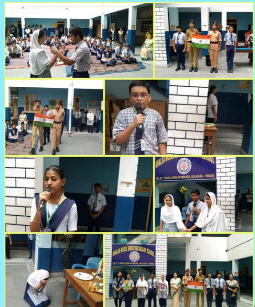
KARGIL VIJAY DIWAS