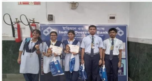
Felicitations of Class X toppers (AISSE, 2024) with Medha Samman by Taaza TV on 14th July, 2024 at Dhonyodhanyo auditorium.