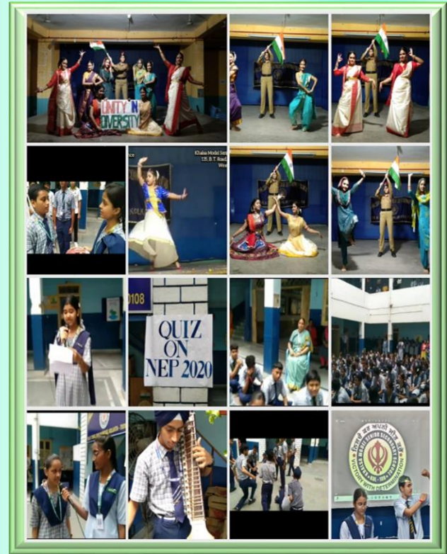
Day 4-CULTURAL DAY