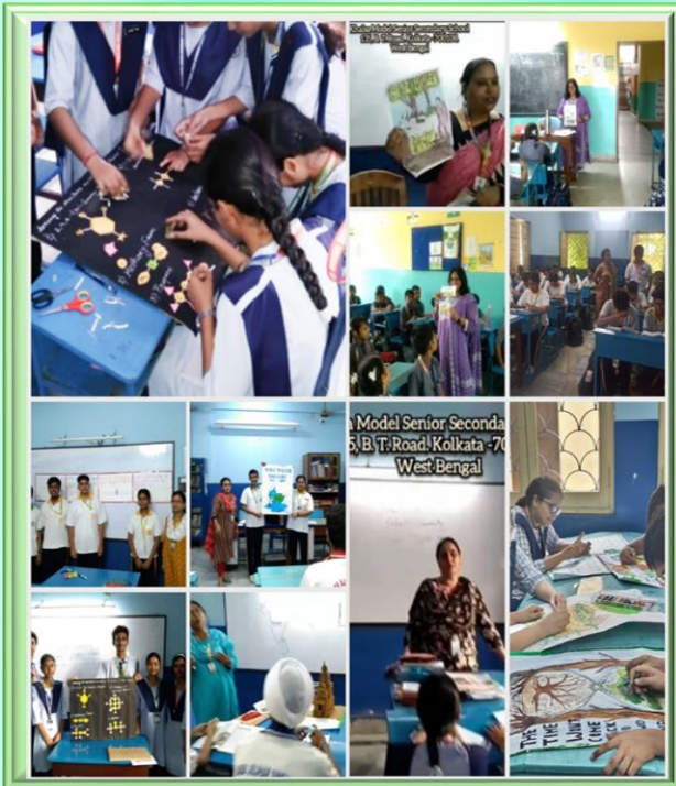
Day 1- TLM DAY