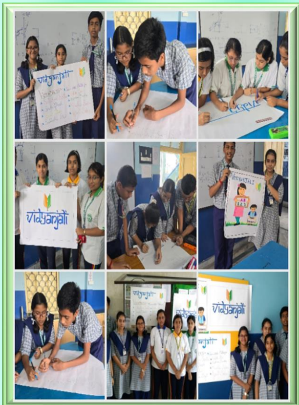
Day 7-COMMUNITY DAY