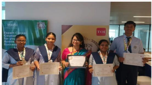
Toppers of AISSE AND AISSCE 2024 were felicitated by Edushine at Dhonyodhanyo auditorium on 5th July, 2024