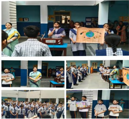
WORLD HERITAGE DAY