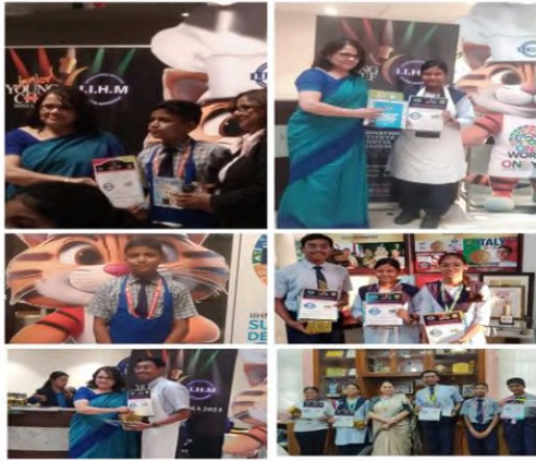
Semi-finalists of junior chef and Young chef competition held on 6 th April, 2024 at IIHM campus