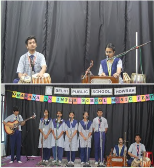
The above mentioned students participated in an Inter school music competition held on 25th April at DPS HOWRAH