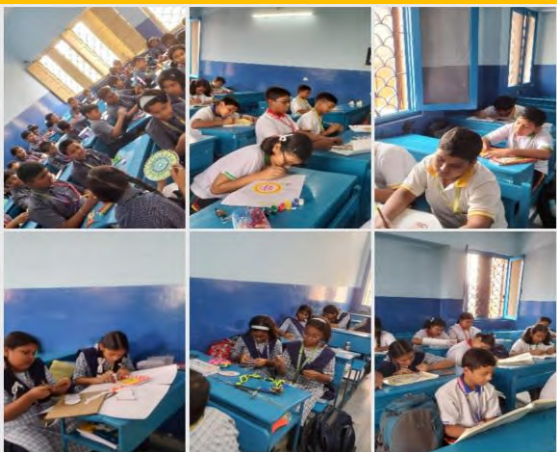
Some Glimpses of Activities for Baisakhi and Bengali New Year