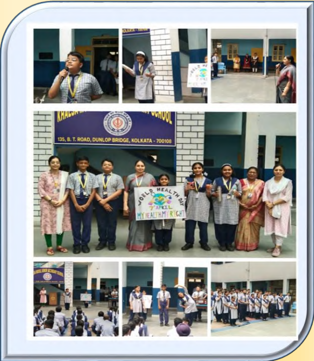
WORLD HEALTH DAY