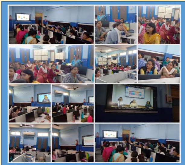
2 Days Online Training Programme for Teachers by CBSE conducted by Ranjana Arora