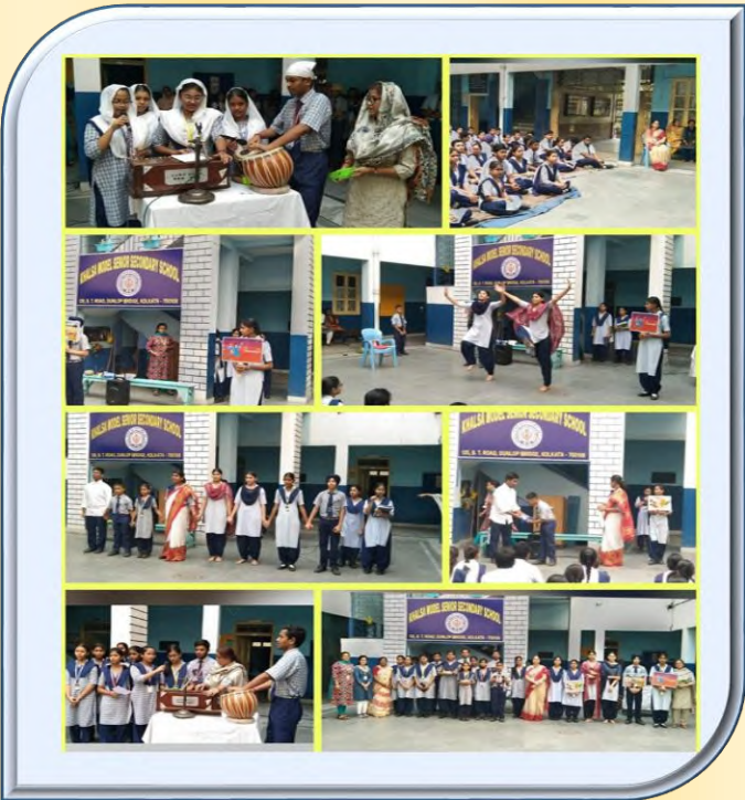
BAISAKHI & BENGALI NEW YEAR