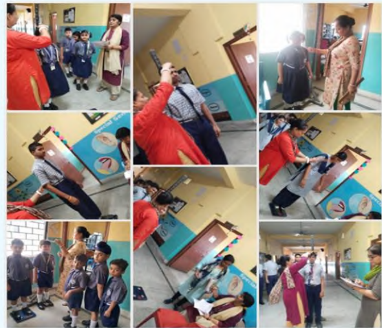
Measurement of Height and Weight of Students