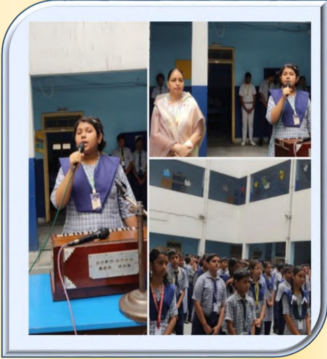
SPEECH ON EID