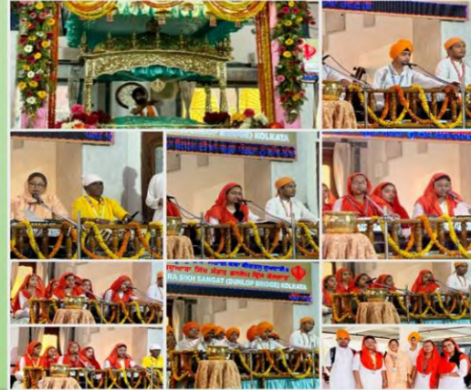
Participation in the celebration of Baisakhi at Gurudwara, Dunlop Bridge