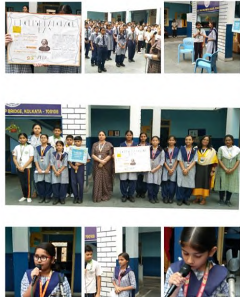
ENGLISH LANGUAGE DAY