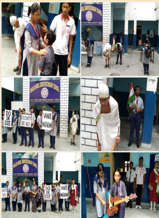
QUIT INDIA MOVEMENT