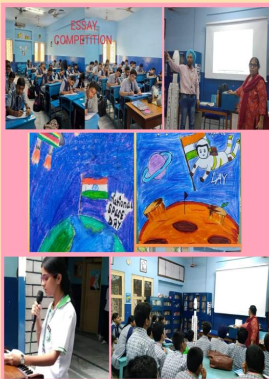
NATIONAL SPACE DAY