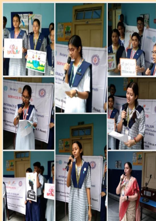
WOMEN'S EQUALITY DAY