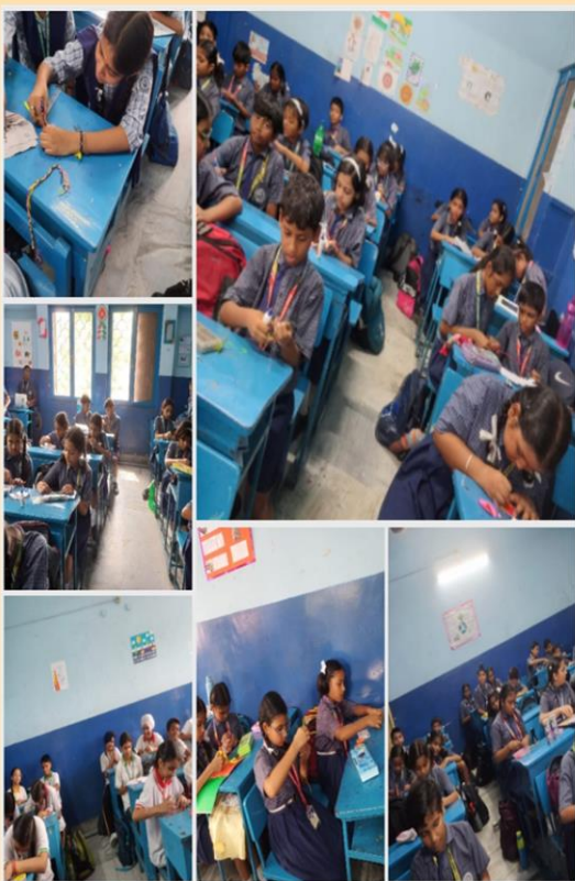
RAKHI MAKING ACTIVITY