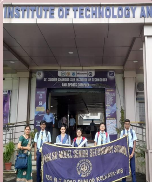
Our students participated in an Inter school model-making competition which was held on 8th August 2024 at Dr. Sudhir Chandra Sur Institute of Technology and Sports Complex and received certificate of participation.