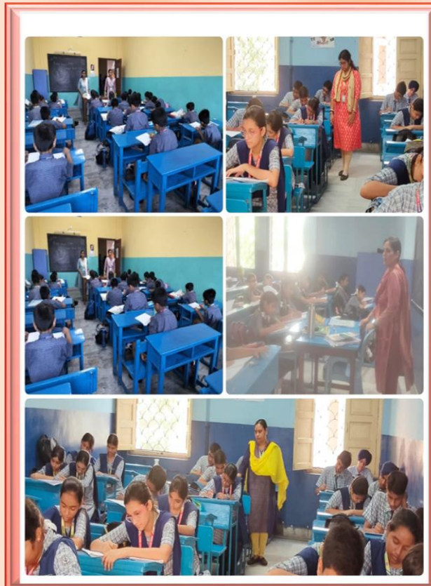
Hindi Olympiad was conducted at School on 6th August, 2024.