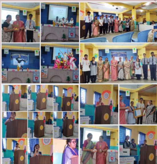
3rd Installation Ceremony of Khalsa Interact Club was held on 2nd August, 2024 in the school auditorium in the presence of Rotarians, Sutanuti