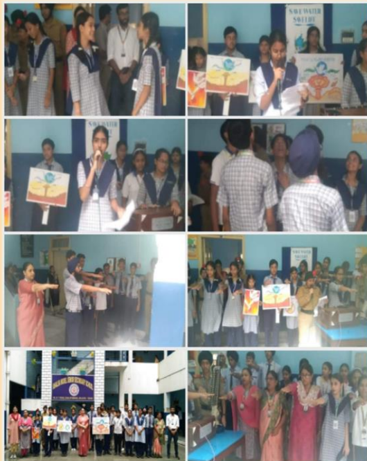
HIROSHIMA AND NAGASAKI DAY