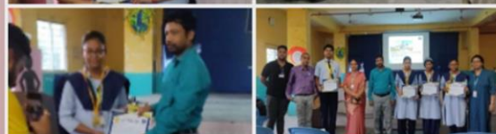
Felicitations of Board toppers (X and XII) and Career counselling for class XII by JIS UNIVERSITY on 13th August, 2024 in the school auditorium