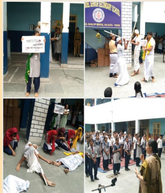
PARTITION HORRORS REMEMBRANCE DAY