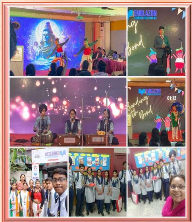
Participation in Emblazon at Aditya Academy Senior Secondary School on 9th and 10th August, 2024