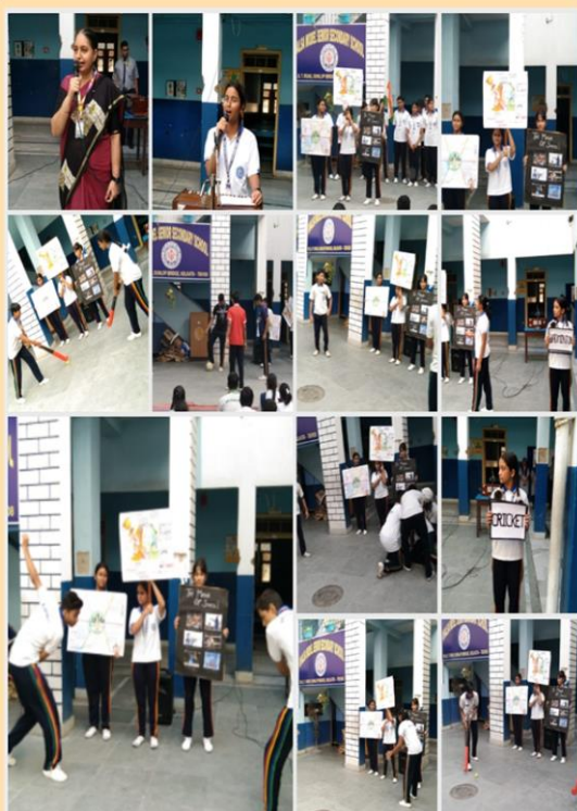
NATIONAL SPORTS DAY