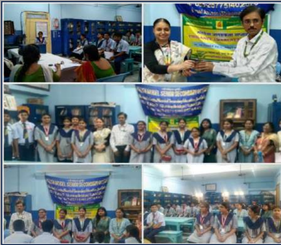
Elocution competition on the topic VIGILANCE AWARENESS was held in the school library on 30.10.23 , sponsored by Punjab and Sind bank,Dunlop bridge.