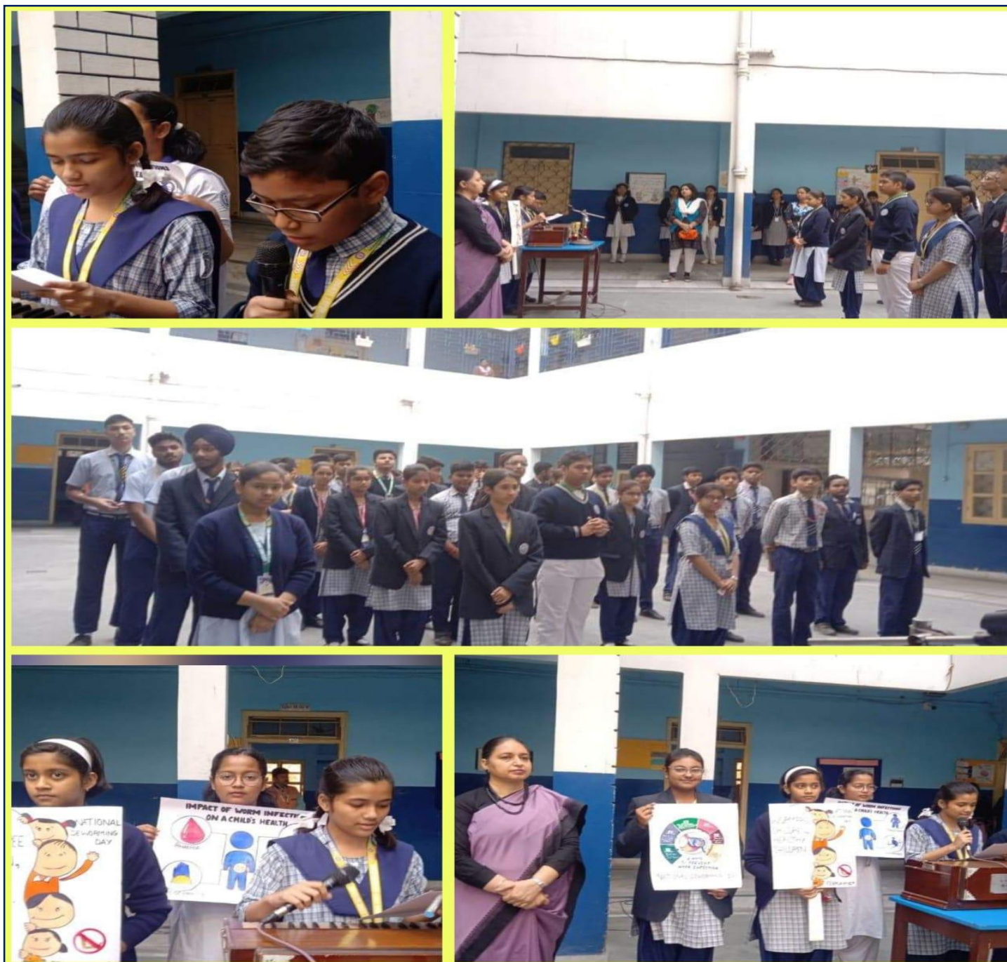
Observation of National Deworming Day in the Morning Assembly on 8 th February, 2024 .It was organised by Baba Fateh Singh Ji House.