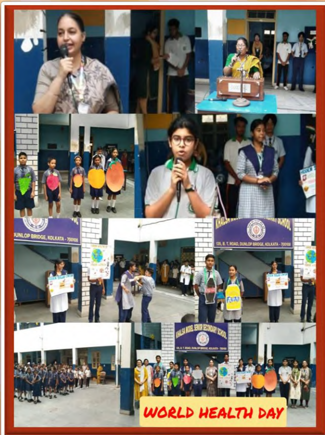
WORLD HEALTH DAY