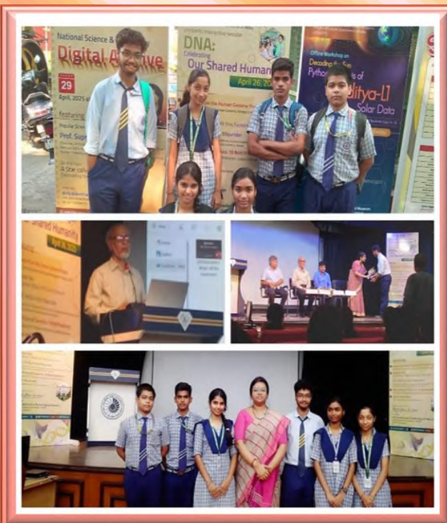
Students of Khalsa Model Senior Secondary School went for a conference at BITM, Ballygunge on 26th April 2025. The conference was a joint venture of Calcutta Consortium on Human Genetics and Birla Industrial and Technological Museum.