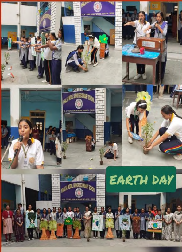
World Earth Day