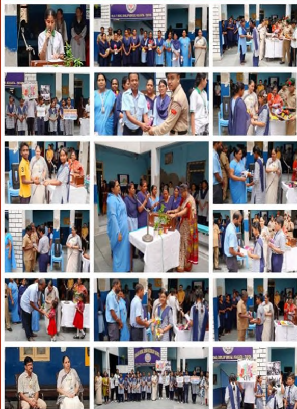
International Helpers' Day