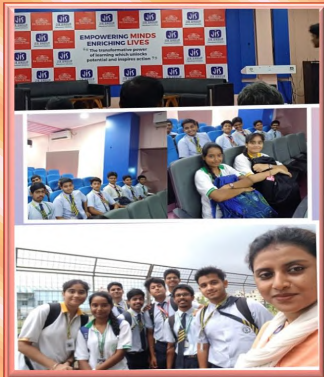
Our students participated in a panel discussion organised by JIS UNIVERSITY at Dr Sudhir Chandra Tech University campus, Dum Dum on 17th April, 2025