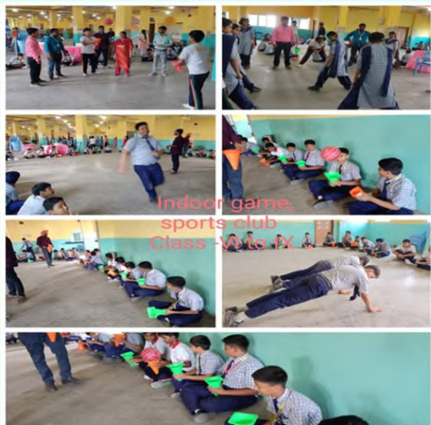
Indoor game, sports club Class - VI to IX