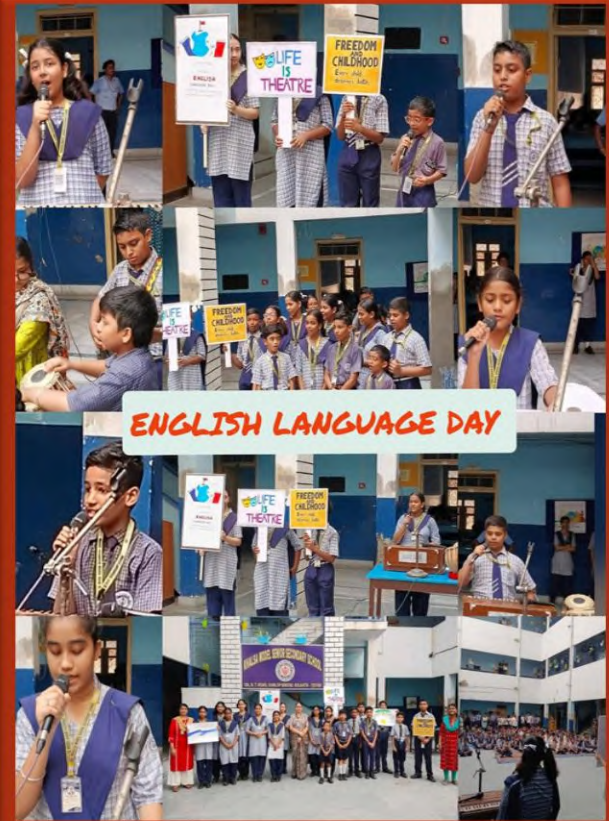
English Language Day