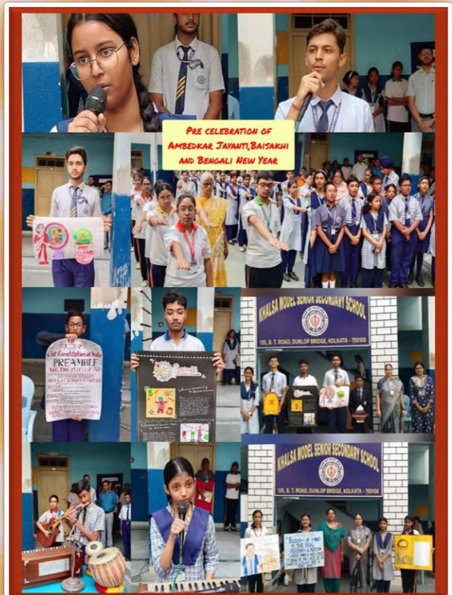
Ambedkar Jayanti, Baisakhi & Bengali New Year