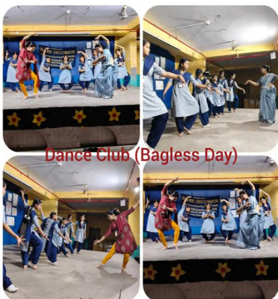
Dance Club (Bagless Day)

As per NEP 2020, KMSSS started "Bagless Days" on second Saturday of every month with a view to focus on experiential and skill-based learning and to encourage hands-on learning, creativity, and holistic development of the students. On 12th April Bagless days were filled with a variety of engaging and enriching activities. Classes VI-IX participated in the activities conducted by the ECO Club, Science Club, Sports Club (Indoor), Performing arts (Dance) and Social Science club (Quiz) of the school. Students of classes' I-III participated in art-n-craft, drama, singing and dancing activities, personality development etc. Students of class I to III were taken to the medicinal garden of the school and were explained the benefits of such plants.