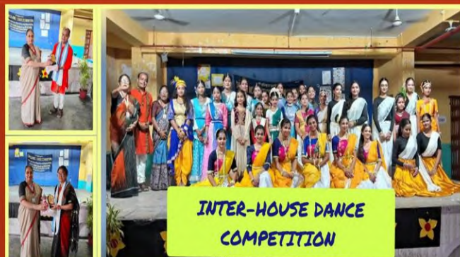
INTER-HOUSE DANCE COMPETITION