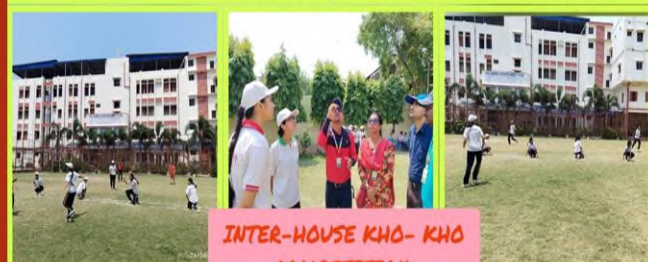
INTER-HOUSE KHO- KHO COMPETITION