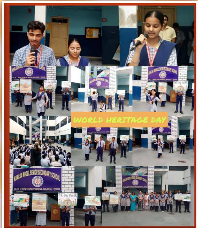
World Heritage Day