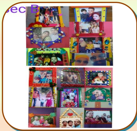
PHOTO FRAME MAKING