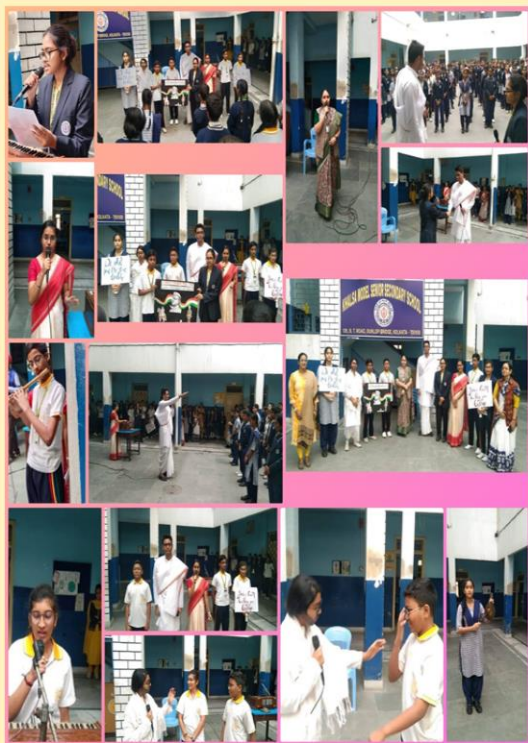
Pre-celebration of birth anniversary of Netaji Subhash Chandra Bose