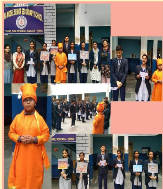
Pre-celebration of Swami Vivekananda Jayanti, Lohri, Makar Sankranti and Pongal