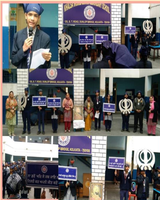
Pre-celebration of Birth Anniversary of Guru Gobind Singh Ji