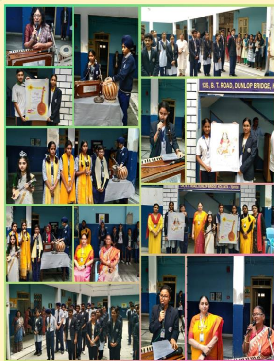
Pre-celebration of Basant Panchami