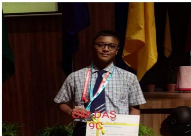
OM DAS 9C