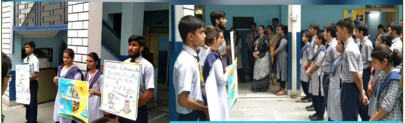
Awareness campaigns on water audit and water conservation was conducted by Eco Club members in the morning assembly on 10 th August,2023