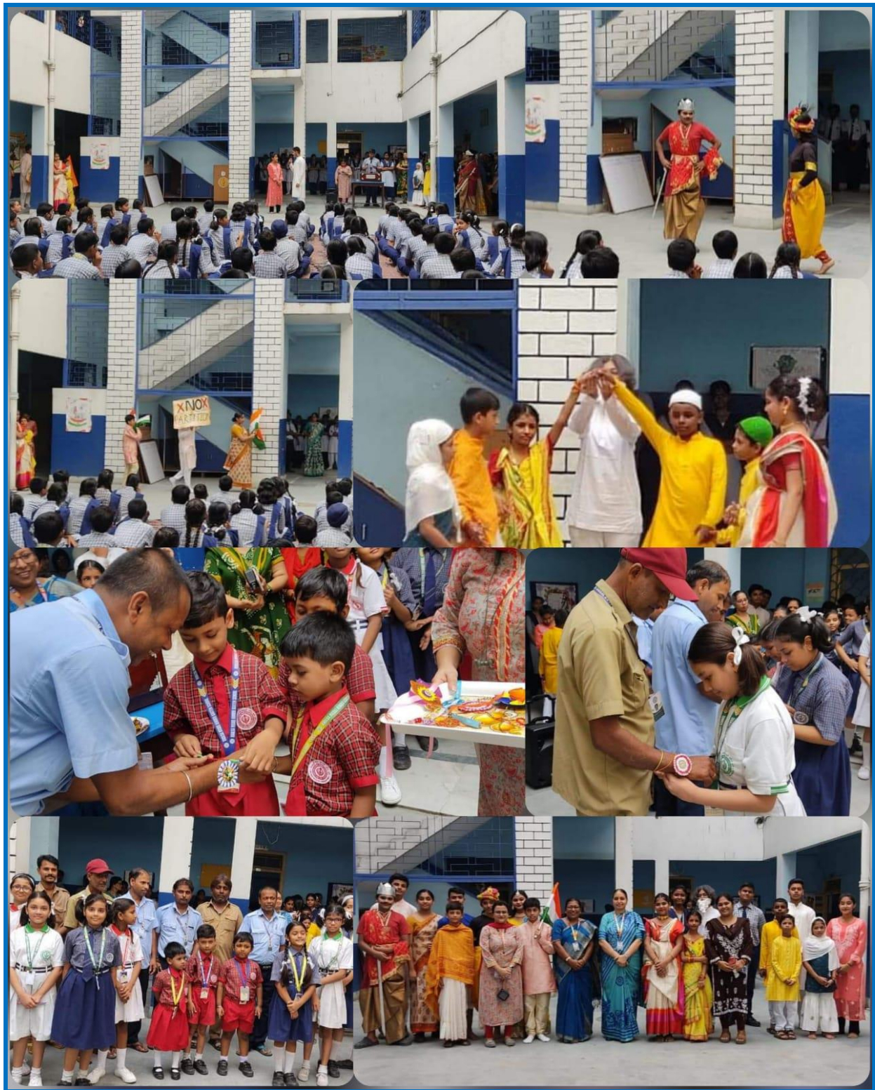
Celebration of RAKSHA BANDHAN in the morning assembly through a skit based on the importance of Raksha Bandhan and by tying rakhi on the wrist of the group D staff to strengthen the bonding between the group D staff and children of our school.