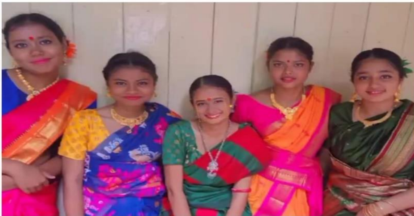
Some of the NCC students, who participated in the group dance competition.