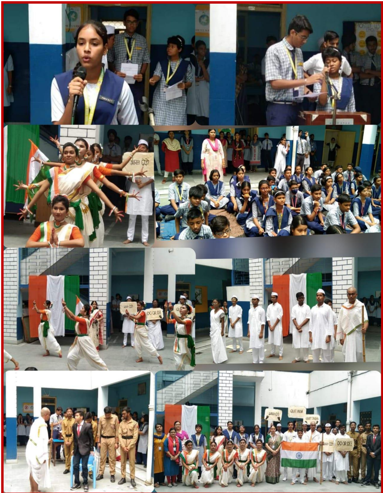
Special assembly was organized in our school on the eve of Independence Day Celebration (14 th August 2023)