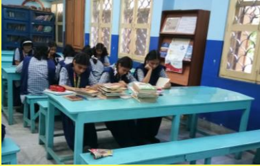
Every Reader is a Star!!!