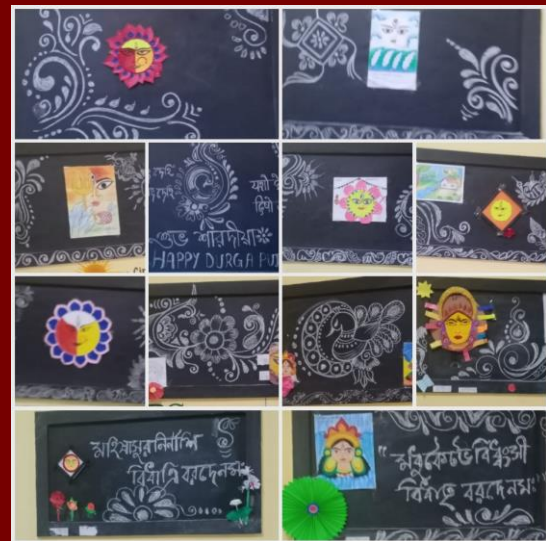
Board decoration by students

The Khalsa family celebrated the Durga Puja. The students presented speech and gorgeous dance performance and the students of the primary section decorated the boards wonderfully with the help of the teachers and it was possible to create such a colourful and charming ambience only because of the efforts put forward by the students and the teachers.