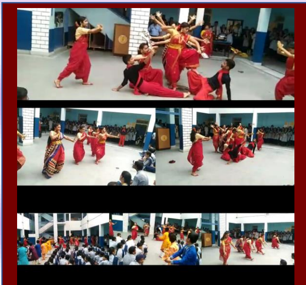
Performances by the students