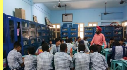
Students engaged in discussion about celebrating festivals