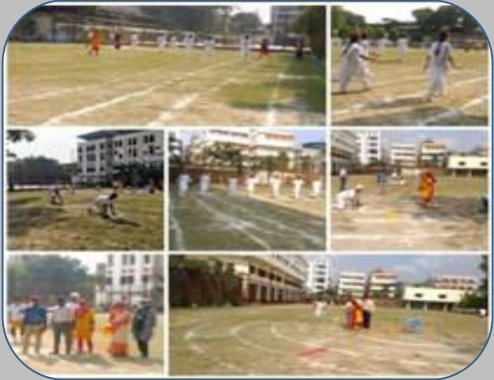
Day 8, Nov 10