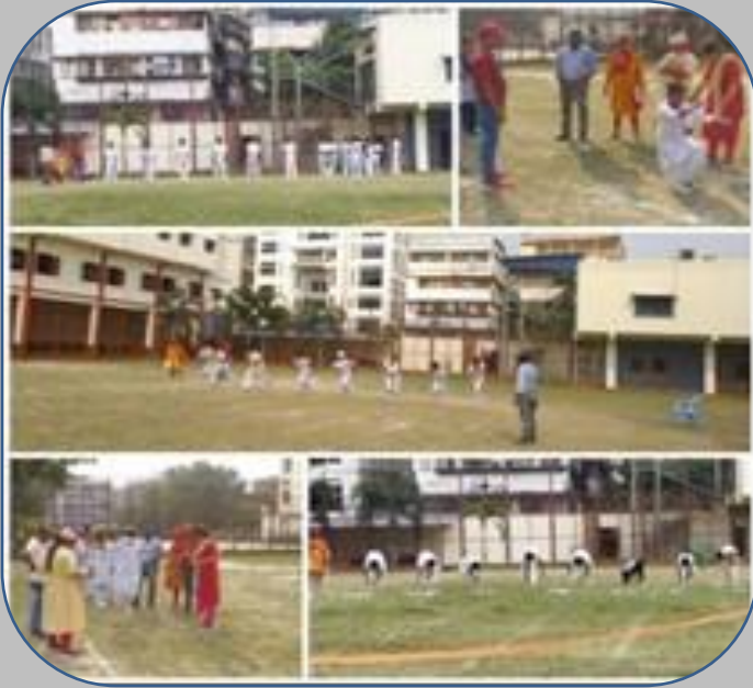
Day 4, Nov 3