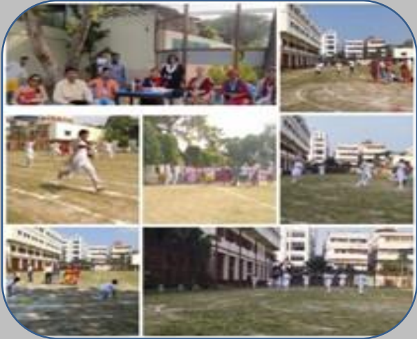
Day 9, Nov 11