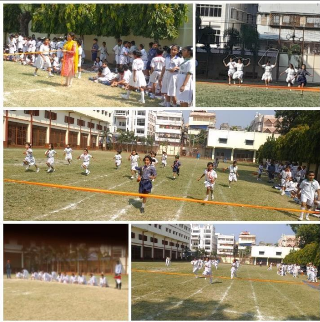
Day 3, Nov 2