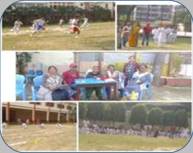
Day 5, Nov 4