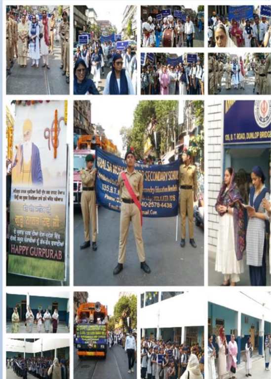
Participation in Nagar Kirtan on 10th November, 2024