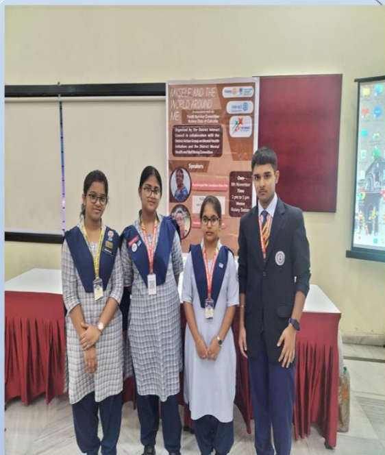
The Interact Club of Khalsa attended the workshop of "MYSELF AND THE WORLD AROUND ME" on 9th November, 2024.