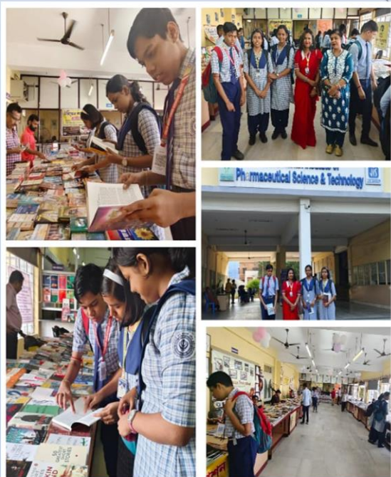
Participation in Book Fair organised by Guru Nanak Institute of Pharmaceutical Science and Technology on 6th November