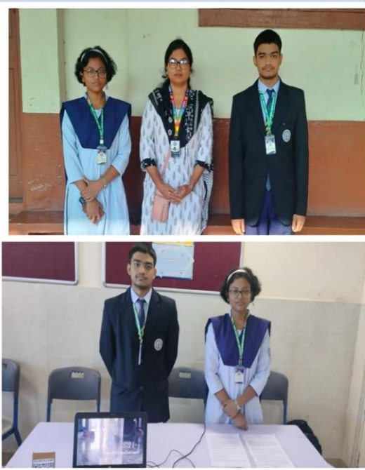
Participation in CBSE Science Exhibition held at BDMI on 8th and 9th November, 2024