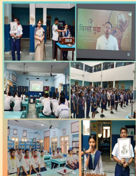
Post-celebration of Birth Anniversary of Birsa Munda