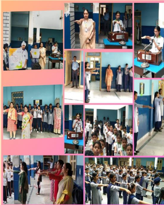
Celebration of Vigilance Awareness Week