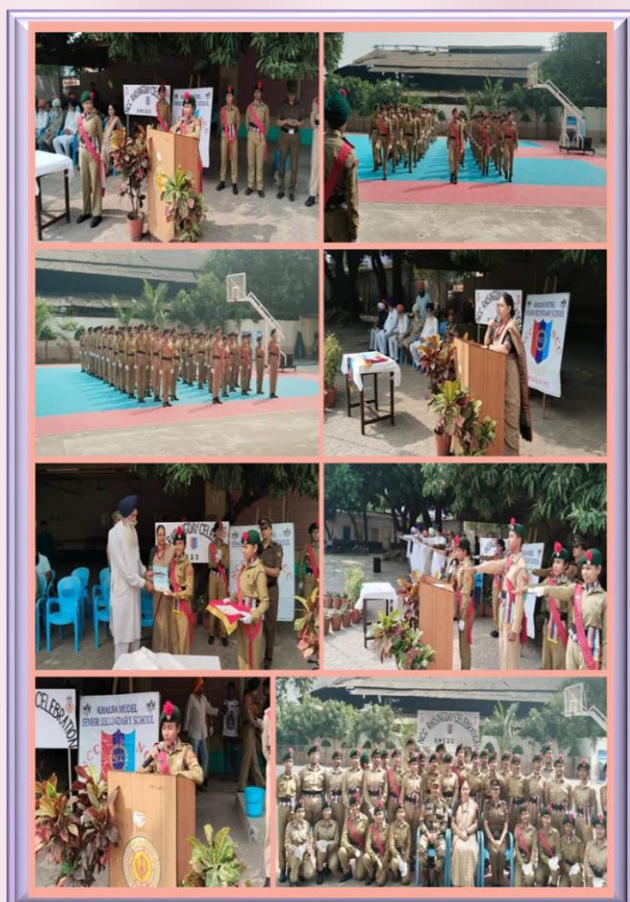
Celebration of NCC Day in the school on 23rd November, 2024