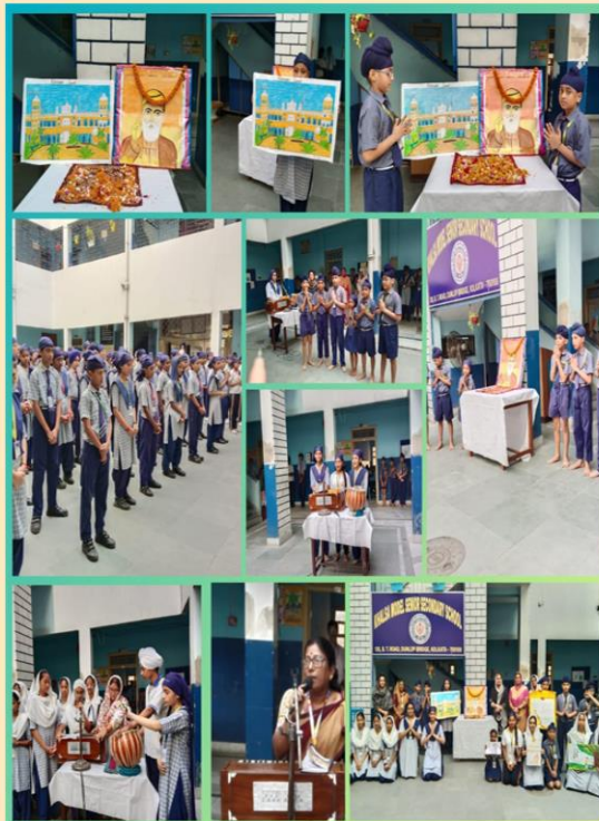
Pre-celebration of Gurupurab