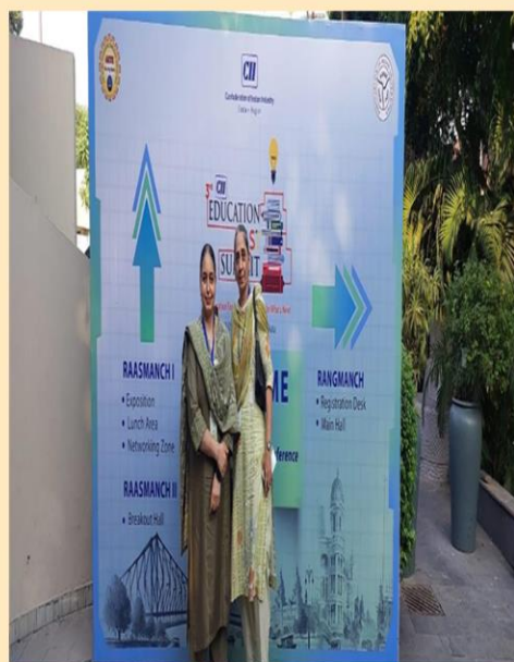
CII 3rd Education East Summit, themed "Navigating the Future – Preparing for what's Next" on 8-9 November 2024 in Kolkata.