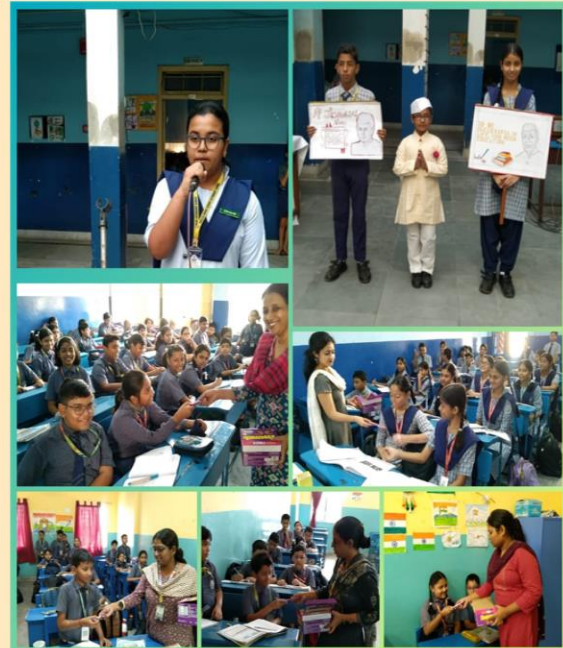
Pre-celebration of Children's Day