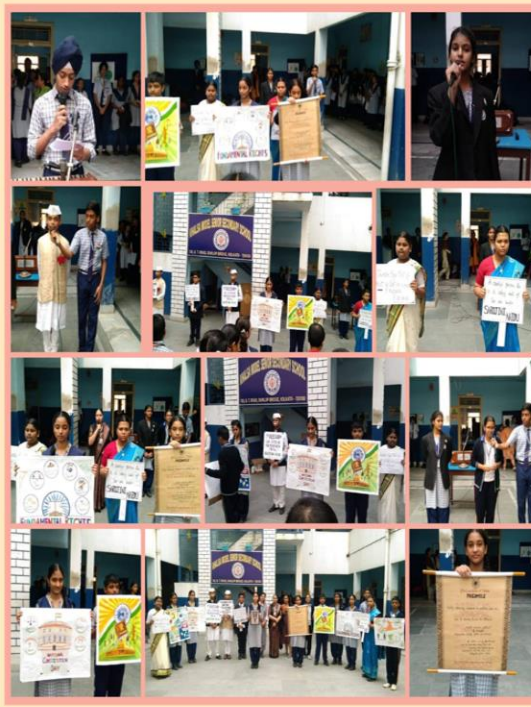
Celebration of Constitution Day