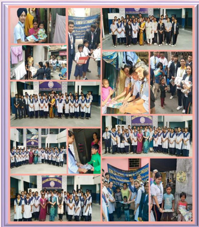
Students of class XI distributed books, clothes and stationeries among the under privileged children on 18th and 19th November.