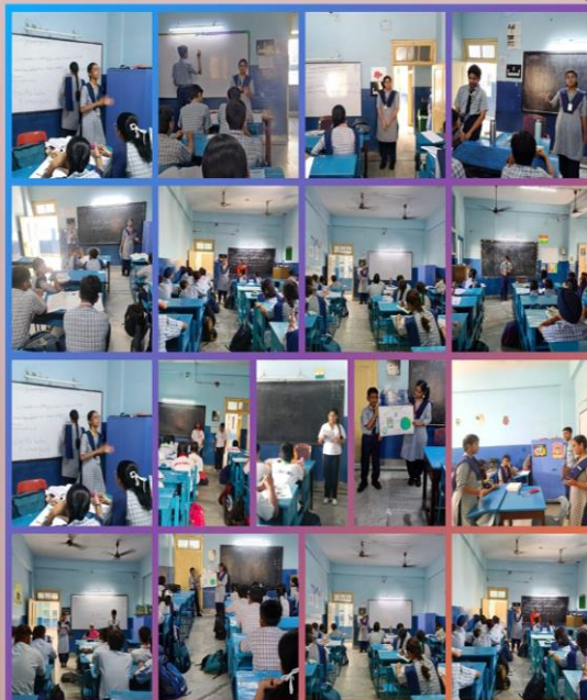
Campaign on E-waste by Eco club members on 11th and 12th November in the school