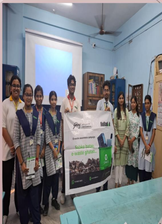
Seminar by HULLADEC on E-Waste disposal on 5th November