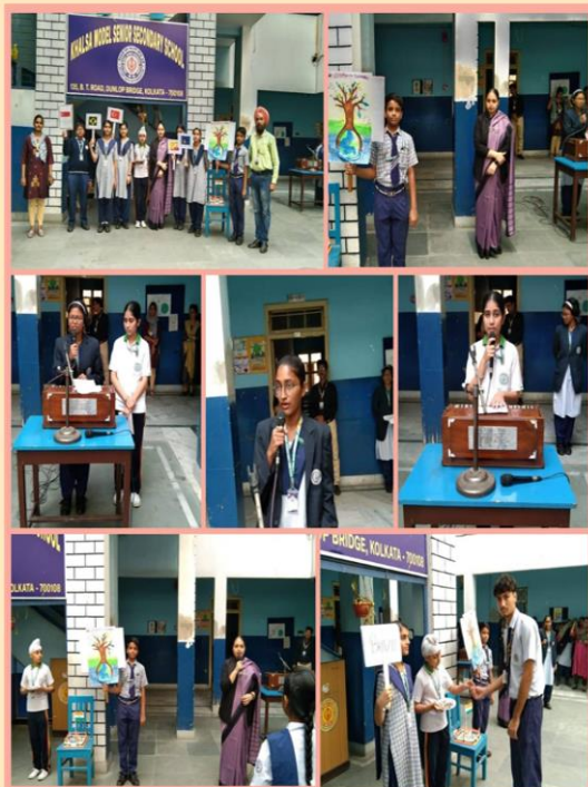
Pre-celebration of Flag Day