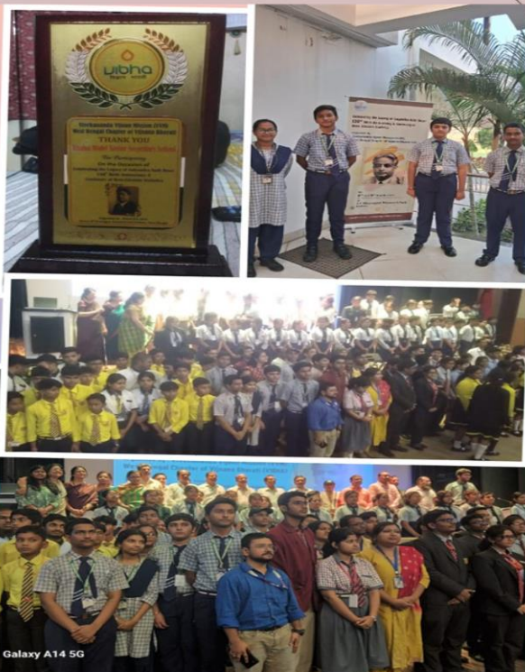
Our students participated in Inter-School Debate, Quiz and Painting Competition at IIT KHARAGPUR RESEARCH PARK on 9th March and received the certificate of participation