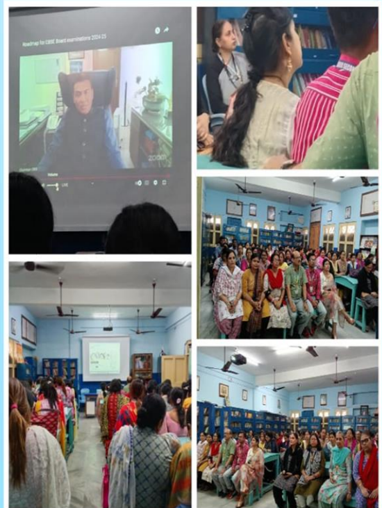
Live Telecast of Roadmap of CBSE Examination 2025 for the Teachers on 14 th February, 2025