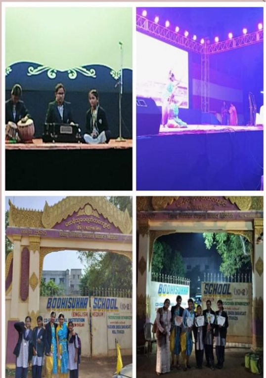
Our students participated in an Inter School Music (Vocal) and Dance Competition on 22 nd December at Bodhisukha School and received 2 nd prize in Music Competition