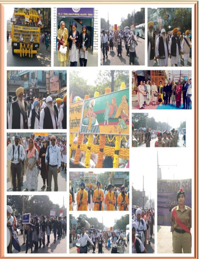
Nagar Kirtan was held to celebrate the Birth Anniversary of Guru Gobind Singh Ji on 29 th December, 2024