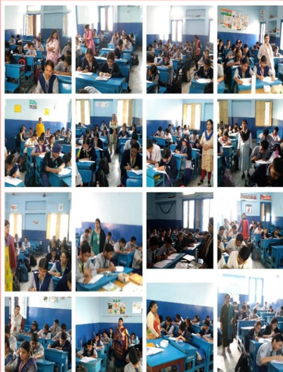
Written Quiz Competition conducted by TAAZA TV on 4 th December, 2024 at our school.