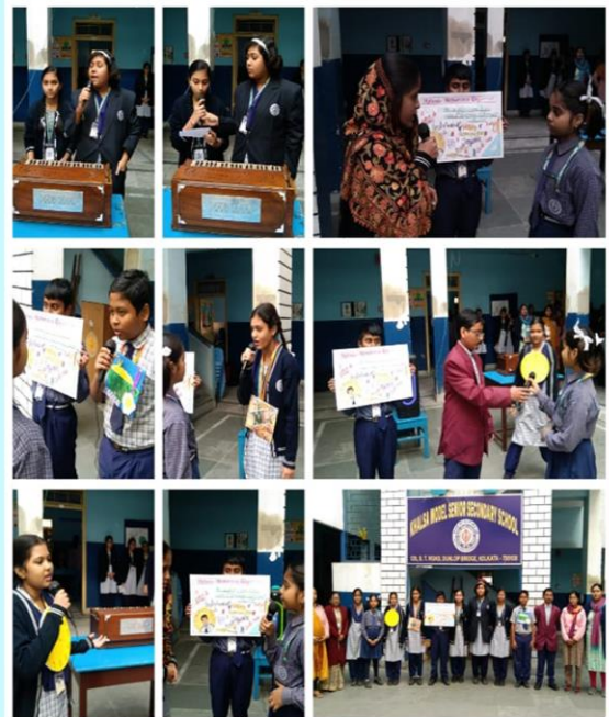
Pre-celebration of National Mathematics Day