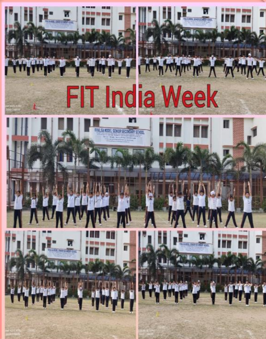
Fit India Week was Celebrated from 16.12.24-20.12.24