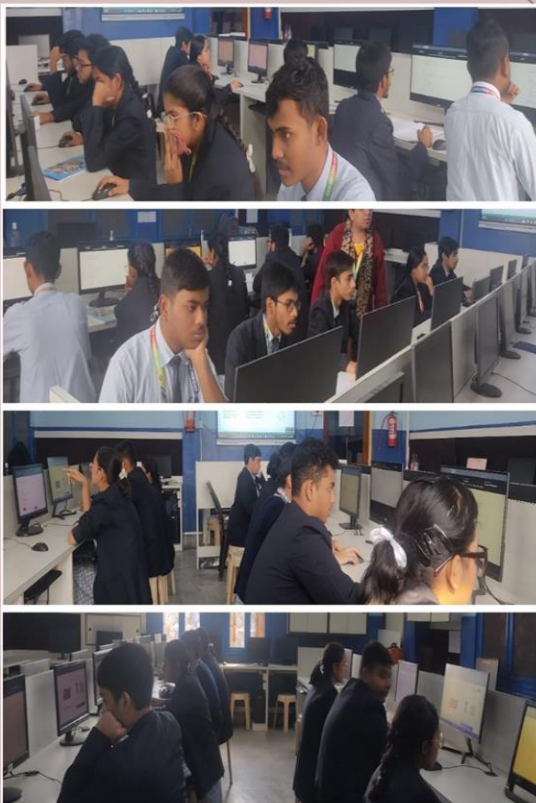
Future Tech Olympiad 2024 was held on 18 th and 19 th December, 2024 for classes VII-IX and XI in online mode.