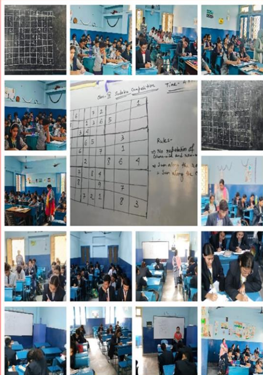
Sudoku Competition for classes VI-IX and XI on 19 th December