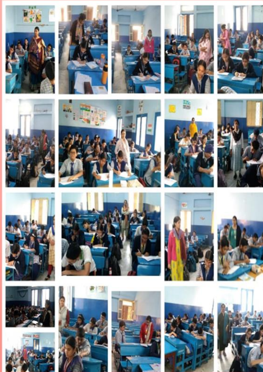
ISSO and Commerce Olympiad on 10 th December, 2024 at our school.