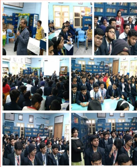
Seminar on Digital Detoxification for class XI by Brainwave University on 19 th December