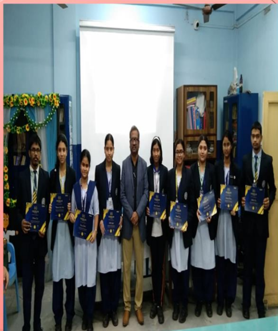
Felicitation of top 10 AISSE toppers by Brainwave University on 19 th December in the school