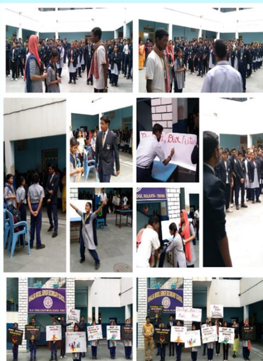
Post-celebration of Human Rights Day