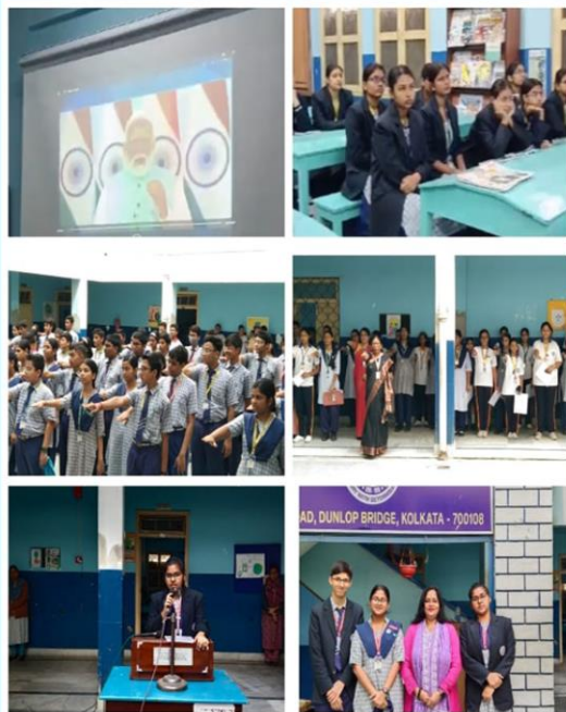
Viksit Bharat Lifestyle for Environment