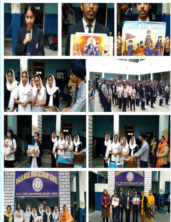
Pre-observation of Veer Baal Diwas