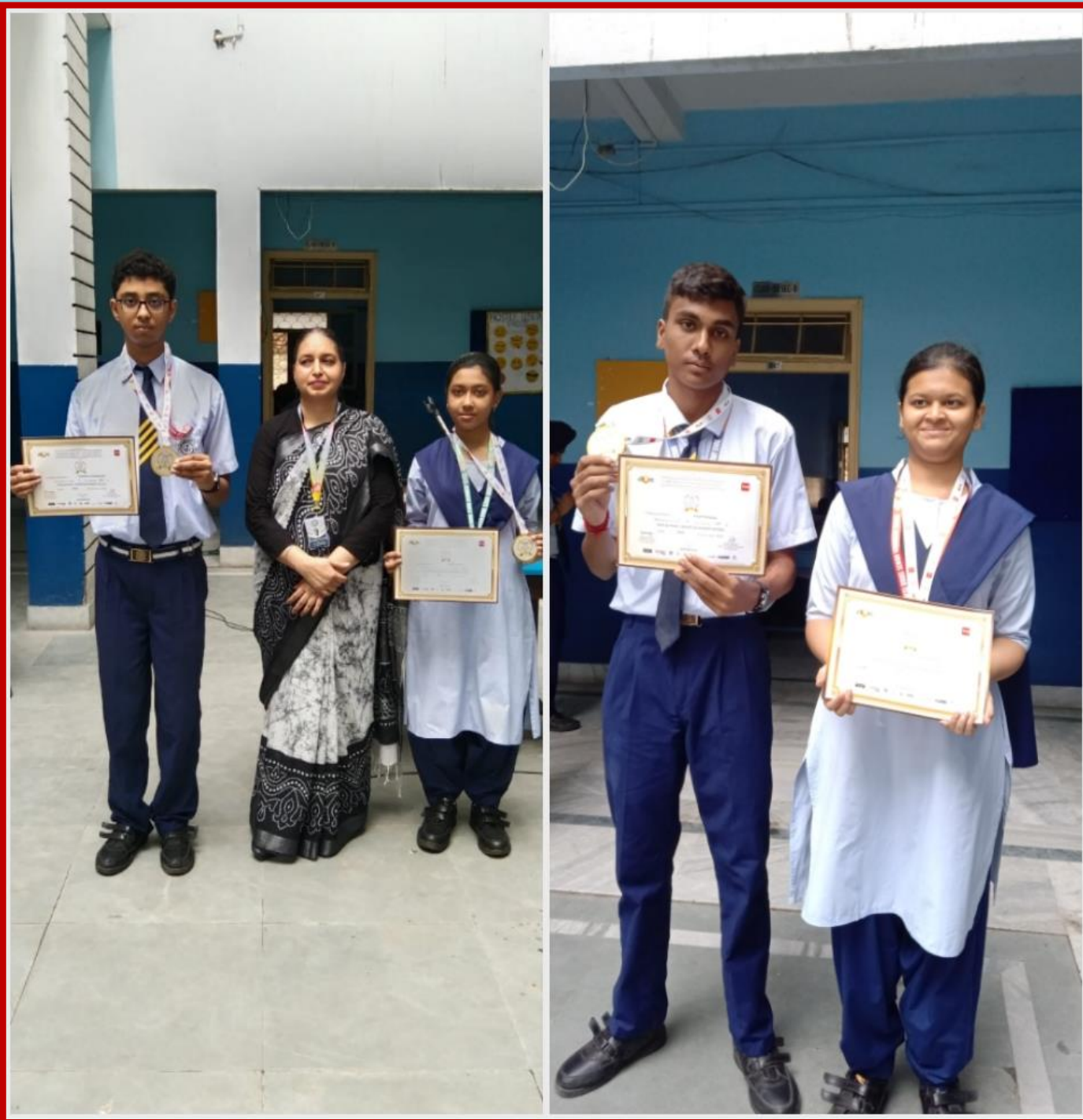
Felicitation of Board Toppers of Class X by Edushine, The Times of India NIE and later in the school.