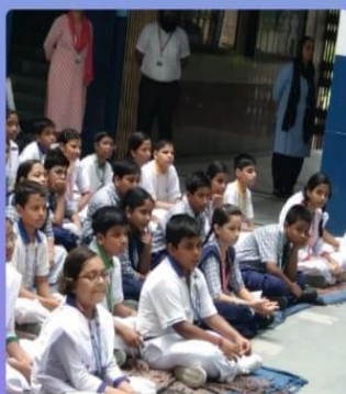
Celebration of Rainy Season in the morning Assembly by the students of Fateh Singh Ji House. Students gave speech, performed a skit and a group dance.