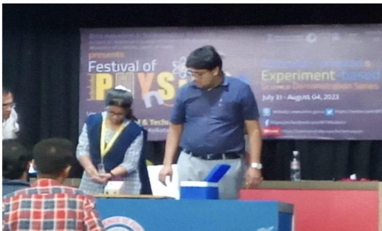
Eight students of Class IX participated in FESTIVAL OF PHYSICS on 31.07.23. Topic of the Day was Experiment on Thermal Physics.