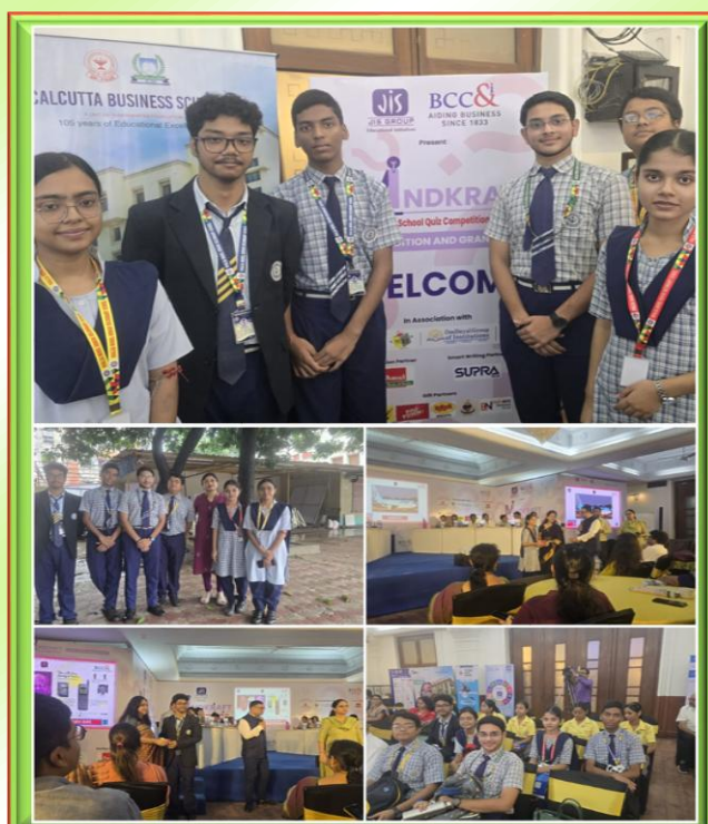
Our students participated in an Inter School Quiz Competition which was held at Bengal Chamber of Commerce on 31st July.