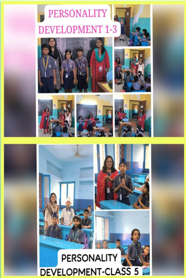
PERSONALITY DEVELOPMENT 1-3