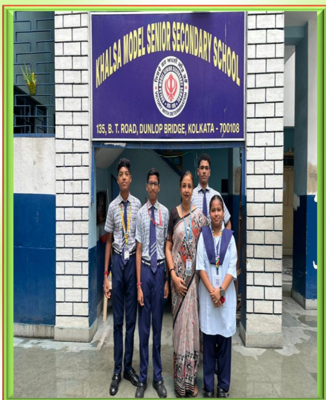
Our students participated in Inter School Painting competition which was organised by JIS University on 31st July, 2025