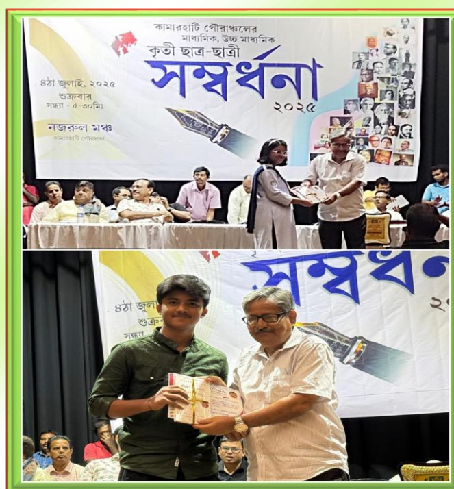
Felicitations of Board Toppers by Kamarhati Municipality on 4th July, 2025