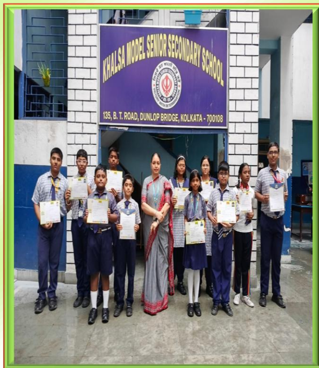
Certificate of Zonal Excellence for second level Olympiad (2024) received on 18th July, 2025