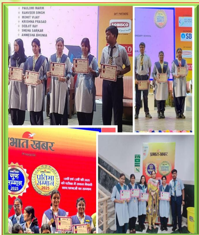
Board toppers were felicitated with Patibha Samman Award by Prabhat Khabar at National Library on 5th July, 2025