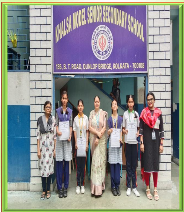
Winners of Painting competition on Dolphin Awareness held on 12th July, 2025