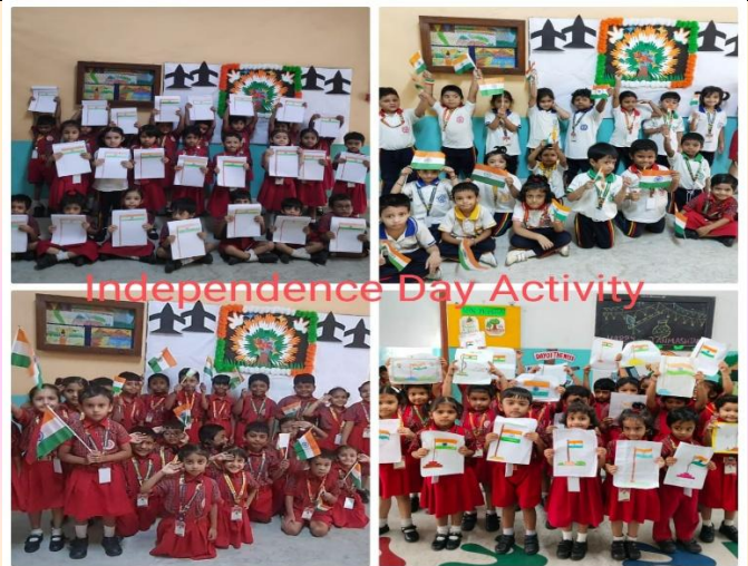
Independence Day Activity

KG tiny tots did the Independence Day Activity by drawing our National Flag giving importance to all the three colors- green for prosperity, saffron for sacrifice and white for peace. It was indeed a wonderful moment for them.