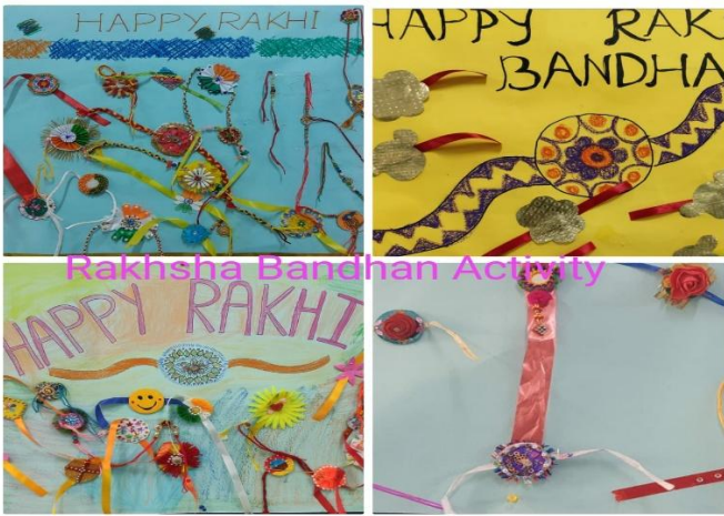
Raksha Bandhan Activity