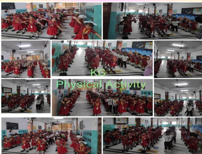
KG Physical Activity