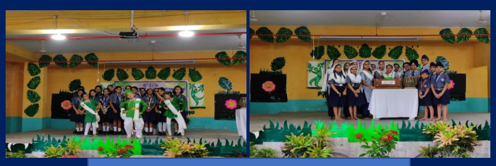
Presentation by the students