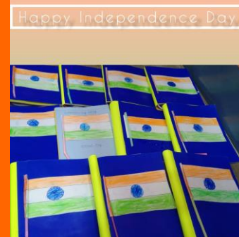
Happy Independence Day