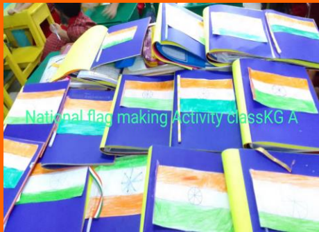
National flag making Activity class KG A