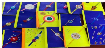
Rakhi making activity KG-D