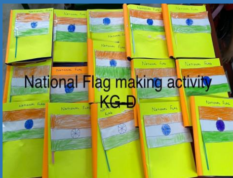
National Flag making activity KG-D