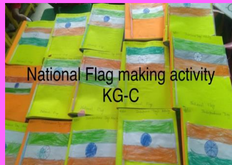
National Flag making activity KG-C